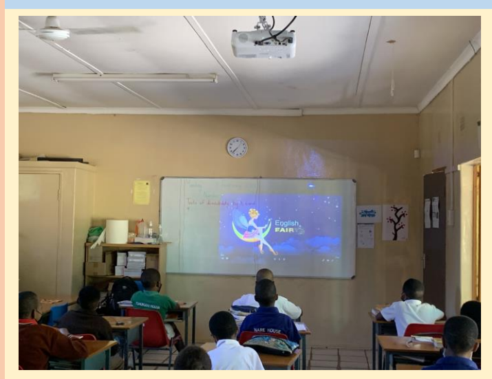
Improved Teaching and Learning Strategies by using ICT

Even though Covid-19 Regulations have been relaxed in relation to sports, Inter-school competitions remain suspended until further notice. Competitions will be inhouse only (inter house competitions).